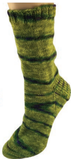
Toe of Newt