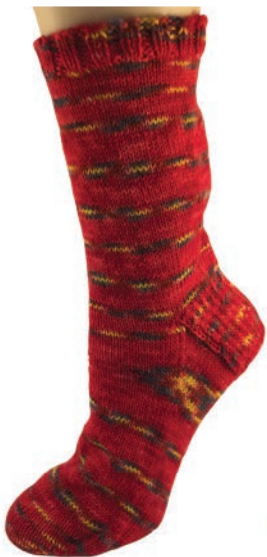
Scale of Dragon