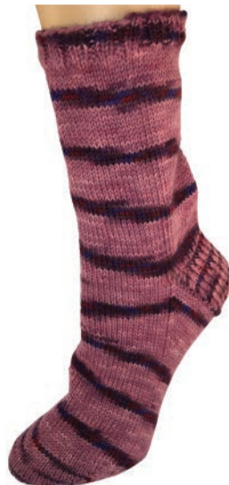
Tongue of Bat